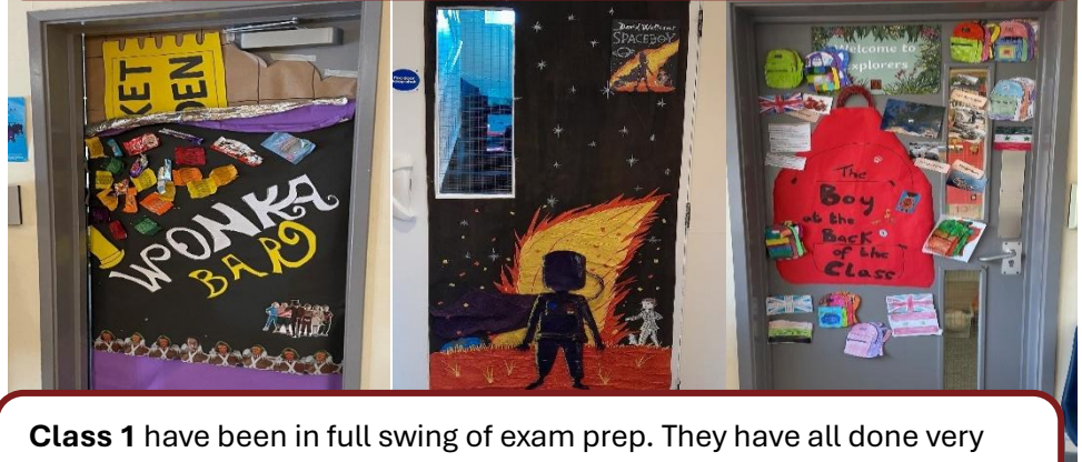
Some of our World Book Day Doors (both Upper and Lower)

Class 1 have been in full swing of exam prep. They have all done very well in their respective mock exams and have a good idea of where they are, in terms of their revision, and what they need to do to achieve their target grades. Time for the final push to ensure they leave with the grades they deserve.